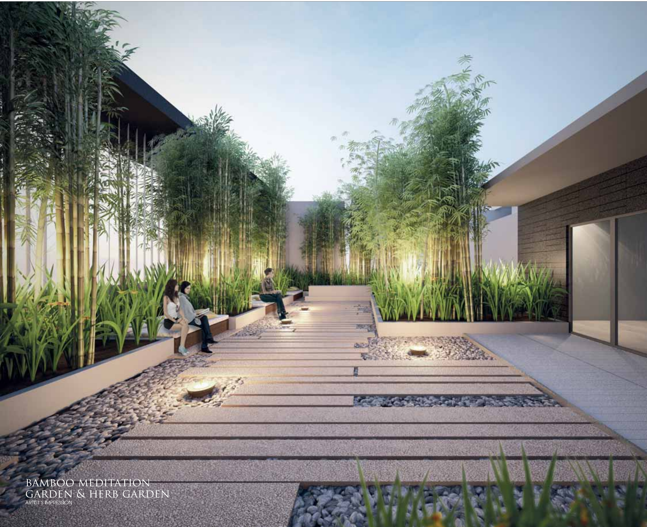
BAMBOO MEDITATION GARDEN & HERB GARDEN ARTIST'S IMPRESSION