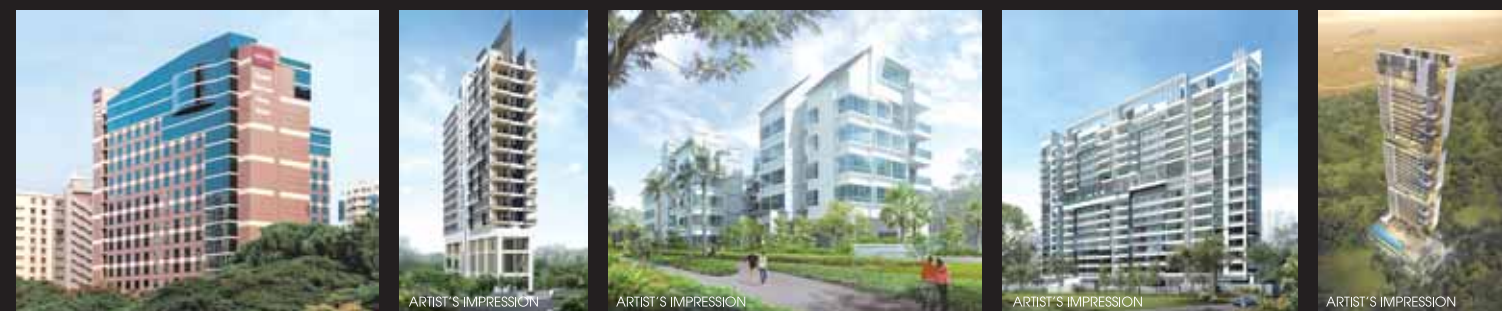
From Left to Right: Grand Mercure Roxy Hotel, The Marque @ Irrawaddy, The Ambrosia, Nova 88, Spottiswoode 18

Our focus on being a developer of distinctive and high quality projects has seen us grow into a highly regarded listed property and hospitality group.